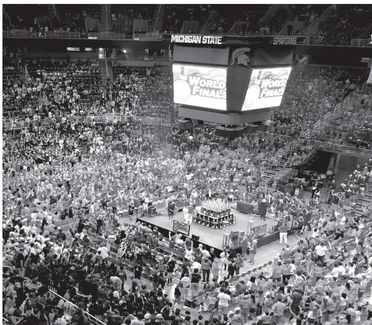
Omer Helps in the T-Shirt Toss